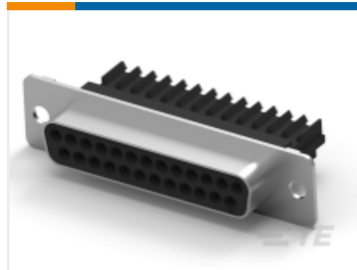
TE Part # CAT-AM7-248H5 IDC D-Sub: Receptacle Assembly, Wire to Wire, Signal, 2.77 mm