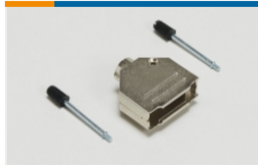
D-Sub Backshells & Clamps(135)